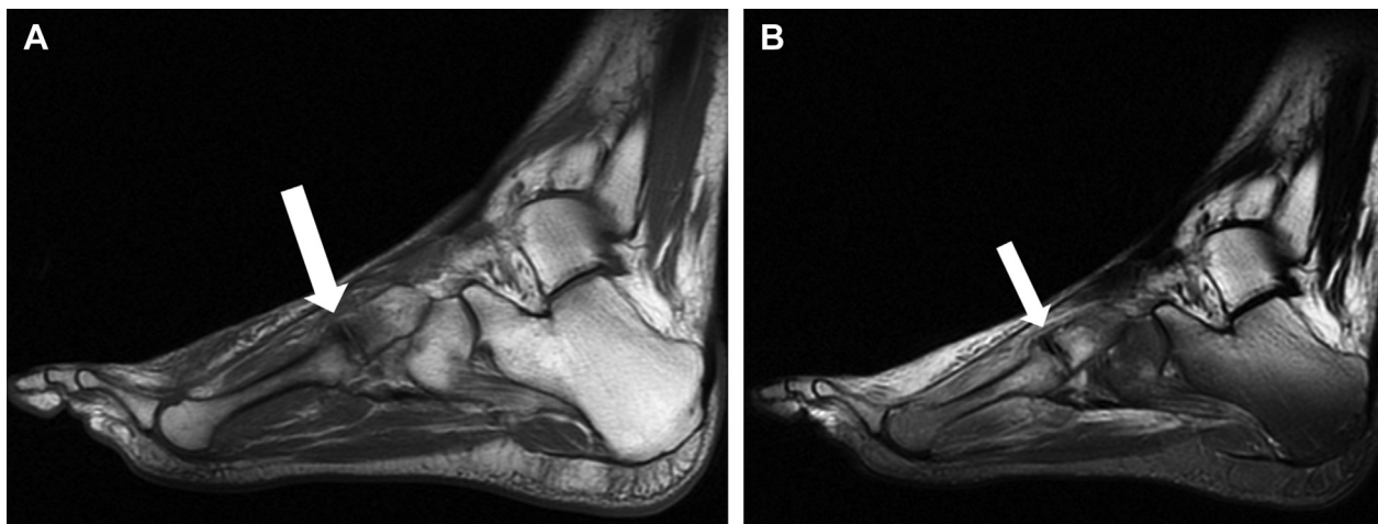
Fig. 3. T1- (A) and T2- (B) weighted magnetic resonance images of the left foot. The arrows show subchondral fractures of the 3rd metatarsal and lateral cuneiform adjacent to the tarsometatarsal joint with extensive surrounding bone and soft tissue edema.

Charcot neuroarthropathic joints are often misdiagnosed as cellulitis, deep vein thrombosis, sprain, or gout. 8 Anyone with diabetes presenting with a hot, red, swollen, insensate foot (or with pain in a previously insensate foot) should be treated as having CN until proven otherwise and referred to a specialist multidisciplinary foot clinic. 4 The modified Eichenholtz classification of CN includes a prodromal stage of disease, where there is no plain radiographic evidence of bone damage (Table). 9 However, MRI has been recognized to show early signs of soft tissue edema, bone marrow edema, subchondral cysts, and microtrabecular fractures. 3,7