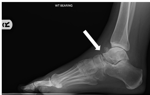
Fig. 1. Lateral plain, weight-bearing radiograph of the right foot and ankle showing an ill-defined osseous body anterosuperior to the talus with a displaced fracture through the anterior aspect of the talus (arrow). There is also bony resorption and callus formation at the fracture margin. WT = weight.

microvascular complications, CN was assumed and offloaded in a removable walker boot.