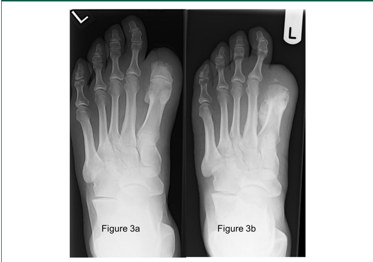
Figure 3. (a) Radiograph of the left foot of Case 3 showing new ossification centre at the site of the stump, with remodelling of the residual proximal phalanx of the first toe and (b) radiograph of the left foot of Case 3 showing new callous formation and periosteal soft tissue swelling at the first metatarsal, with new erosions at the medial aspect and a periosteal reaction at the lateral aspect.

We present an illustrative case series of pedal Myositis ossificans in three individuals with pre-existing diabetes related foot disease. All subjects gave written consent. We suggest that this rare condition may be frequently overlooked in people with diabetes and may occur more frequently as the prevalence of diabetes related foot disease increases.