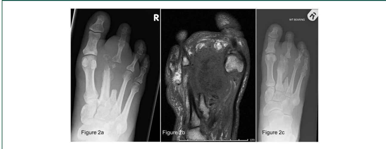
Figure 2. (a) Radiograph of the right foot of Case 2 showing new bone destruction centred on the neck of the second metatarsal with dislocation of the second metatarsophalangeal joint, in keeping with osteomyelitis, (b) Magnetic resonance imaging of the right foot of Case 2 showing extensive osteomyelitis within the second metatarsal with bone fragmentation of the metatarsal head and involvement of the metatarsophalangeal joint, as well as extensive periosteal inflammatory phlegmon formation around the second metatarsal shaft and (c) radiograph of the right foot of Case 2 showing ongoing exuberant bone formation, bony erosion and periosteal reaction of the right second metatarsal.