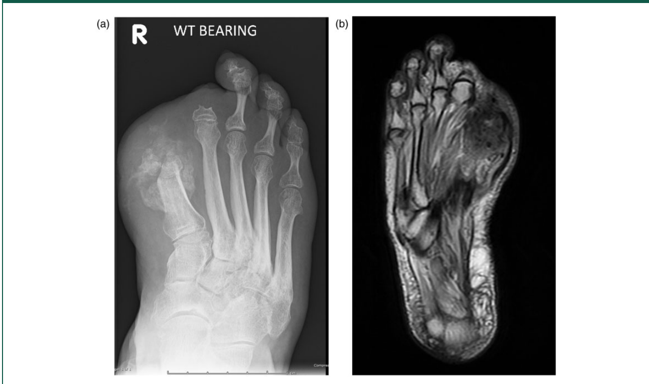
Figure 1. (a) Radiograph of the right foot of Case 1 showing exuberant new bone formation adjacent to the hallux metatarsal and previous first and second toe amputations and (b) T2-weighted sequence magnetic resonance imaging right foot of Case 1 showing a soft tissue mass on the plantar and medial aspect of the first metatarsal.

and osteomyelitis. On examination, the wound appeared clean and a small piece of bone was removed. Radiographs of the foot showed new bone destruction centred on the neck of the second metatarsal with dislocation of the second metatarsophalangeal joint, in keeping with osteomyelitis (Figure 2(a)). In accordance with our local antibiotic protocol, he was started on a course of oral co-amoxiclav. 1 Despite this, an magnetic resonance imaging scan done three weeks later showed extensive osteomyelitis within the second metatarsal with bone fragmentation of the metatarsal head and involvement of the metatarsophalangeal joint. In addition, there was extensive periosteal phlegmon formation around the second metatarsal shaft (Figure 2(b)). Despite these radiological findings, the patient was reluctant to pursue surgical options, opting for another course of broad spectrum antibiotics. Another magnetic resonance imaging scan performed 6 weeks later showed persisting osteomyelitis involving the second metatarsal, with an increasing larger concentric soft tissue mass along the shaft of the second metatarsal associated with bony destruction. However, clinically his foot had no swelling or erythema. Over the subsequent two months he had ongoing debridement and